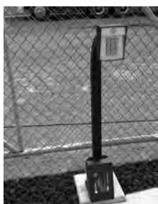
At the base of a pole