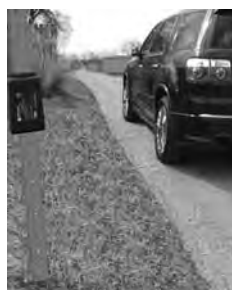
3-foot high for greater range