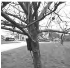
DA-611TO installation with the Sensor buried under the drive and the Transmitter hidden/mounted on a nearby tree.