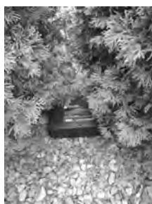
Under landscape next to the drive