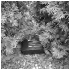
DA-610TO installation with the Sensor/Transmitter hidden under landscaping next to the driveway.

The address codes for these Sensor/Transmitters, as well as the Control Panel/Receivers are pre-set at the factory. However, if a unique address code is needed (e.g. interference from a neighbor's Mier wireless Drive-Alert) you can change the address codes making sure you do so in both the Sensor/Transmitter AND the Control Panel/Receiver so they are different than factory spec, but still match one another. (See next page for directions)