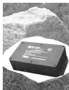
Under a DA-ROCK1 fake rock next to the drive