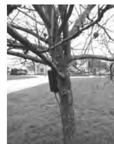
DA-611TO transmitter box in a tree for greater range